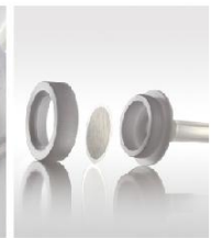
Wash bottle filter