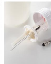
Waste water sensor